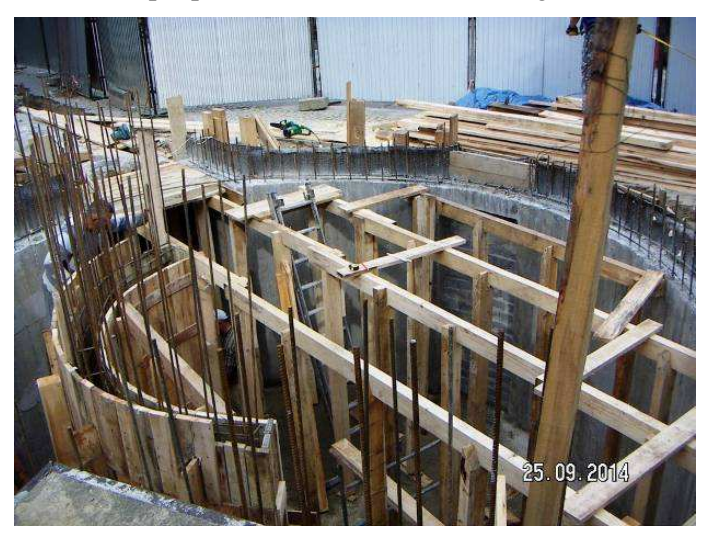
Fig. 5. Przemyśl – implementation of the underground rotunda - the entrance to the underground tourist route

[1]. Security and access to historical excavations also requires, in the last phase of this work, to draw up a plan for the safe use of underground monuments.