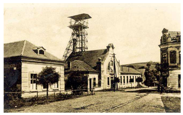
Fig. 1. XIII-century shaft Sutoris in KS Bochnia, functioning until now –picture from early XX c.

considerable historical, aesthetic and social value. In many cases, their location and formation determined the social and spatial development of urban complexes, industrial centres and settlements. Their existence is a testament and image to the development of engineering and technology ideas.