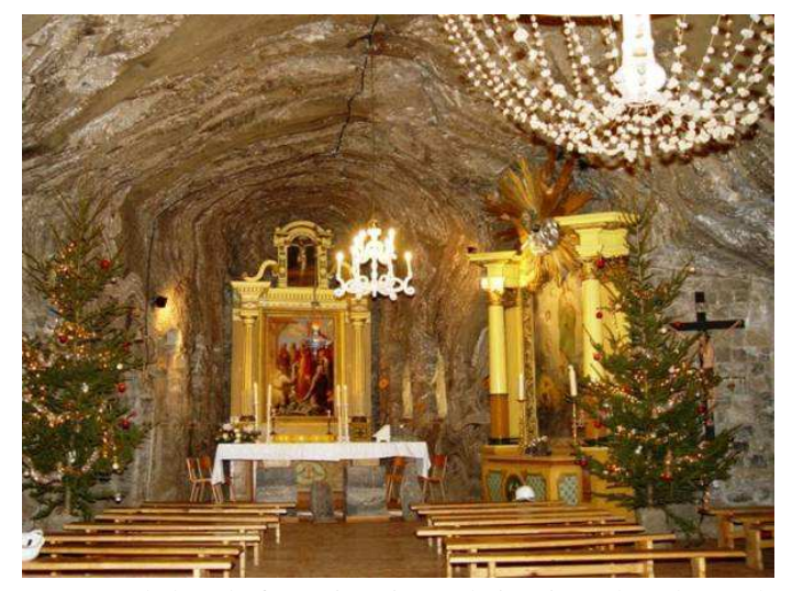
Fig. 4. Protected chapel of St. Kinga in Bochnia mine

The implementation of these tasks is essential to compile a project of underground vintage protection, in which one can determine: security in the process of protection and adaptation of old excavations and underground facilities, rules for the selection of security methods in the context of heritage preservation of the underground, methods of securing orogen, technologies of conducting security works, comprehensive protection of natural and cultural structures and monitoring of underground workings along with the environment