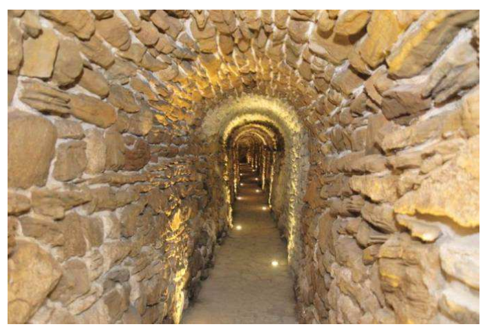
Fig. 2. Made available for tourists medieval sanitary collector in Przemyśl

Underground historic buildings are often located in areas districts and towns with budgets which do not allow for the comprehensive preparation of investments. Therefore, it is important to raise funds outside the budget. Great support in the implementation of these projects are EU subsidies to protect cultural and natural heritage of the area. An example of such implementation was to raise funds for the protection of, among others, old adits in Kamienna Góra and Bedzin, medieval collector in Przemyśl and historic excavation voids in Tomaszów Mazowiecki (Groty Nagórzyckie) [3, 4].