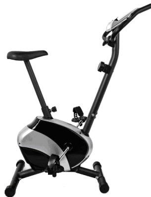
Fig.1. Stationary exercise bicycle SG-911B FALCON.

The object of the research was a stationary bike FALCON SG-911B SAPPHIRE (Fig.1). Motion transmission system consists of the crankshaft having a pulley driven through the pedals (with the possibility of pedalling backwards), the flywheel driven by a belt and a mechanism of resistance.