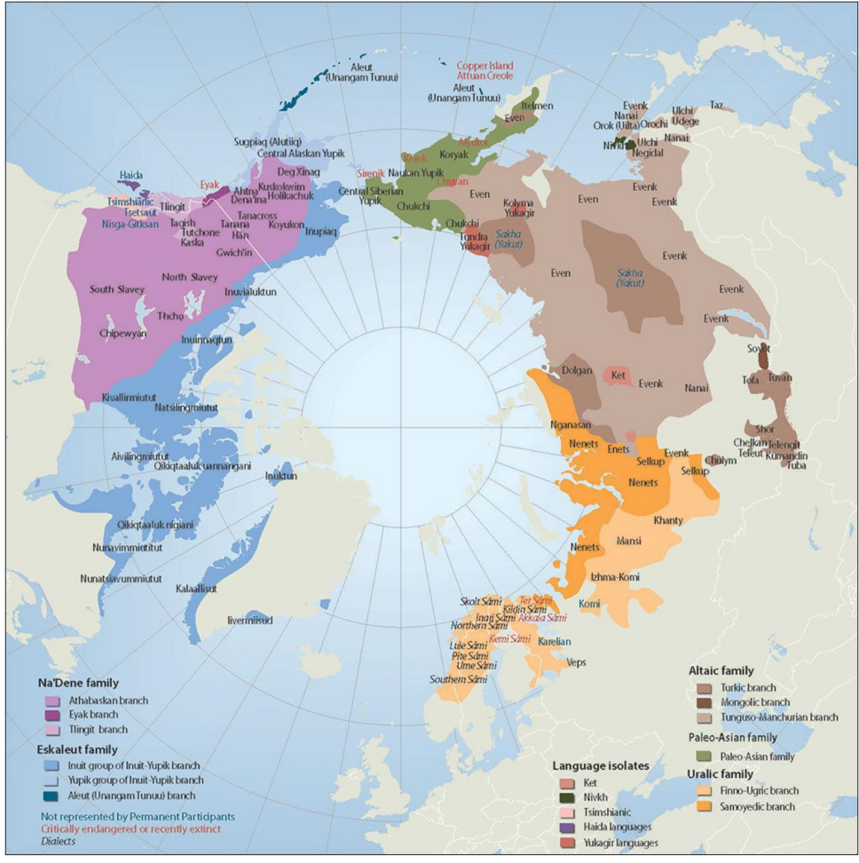
Figure 1. Indigenous peoples of Arctic

Nowadays, the Arctic indigenous peoples include, e.g. Saami in the circumpolar areas of Finland, Sweden, Norway and Northwest Russia, Nenets, Khanty, Evenk and Chukchi in Russia, Aleut, Yupik and Inuit (Iñupiat) in Alaska, Inuit (Inuvialuit) in Canada and Inuit (Kalaallit) in Greenland. All of the above-mentioned countries except for Iceland have indigenous peoples living within their Arctic territories. Official statistics do not necessarily recognize indigenous populations separately although differences occur. The