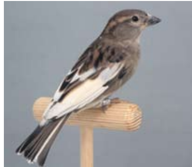
12. House Sparrow, adult female, hatched in the wild but kept in captivity. White feathers caused by Progressive Greying. Typical pattern in which the flight feathers are affected first.