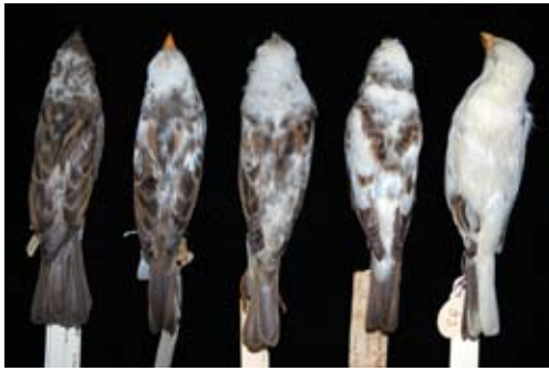
13. House Sparrows, five adult females showing progressive Greying in different degrees. Specimens in the American Museum of Natural History.