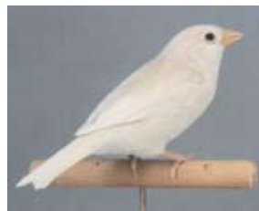
29. House Sparrow, adult female, Ino - light form, bred and kept in captivity.