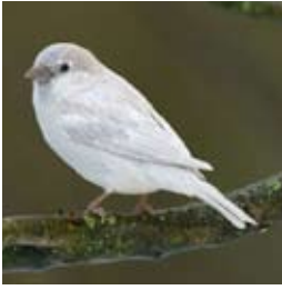
19. House Sparrow, adult male, Dilution – pastel, one of the distinct forms in the pastel-group; a strong but equal reduction of both melanins. January 2011, Maarn, The Netherlands.