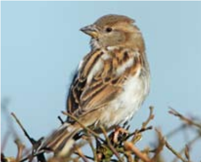
9. House Sparrow, adult female, March 2011, Diksmuide, Belgium. White feathers caused by Progressive Greying (about 25% white feathers).