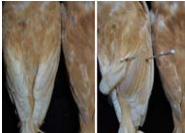
3. An examination of plumage areas shielded from daylight eg. the inner webs of flight feathers, reveals the unaffected aberrant colour. Brown House Sparrows, females.