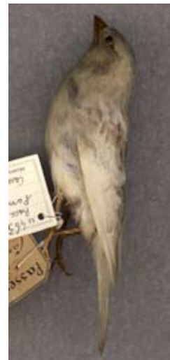
40. House Sparrow, adult male. Grizzle. The whitish appearance is due to the an intermixture in each feather of white barbs and normal coloured barbs. Specimen in the collection of the Museo di Storia Naturale, Florence.