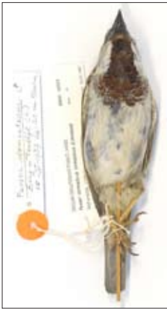
37. House Sparrow, adult male, Melanism category 3 with a clear reddish-brown bib due to an abnormal deposit of pheomelanin. Specimen part of van Heurn's collection and now in NCB Naturalis, Leiden.