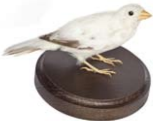
11. House Sparrow, adult female. White feathers caused by Progressive Greying. Typical pattern in which the body plumage is affected first. Specimen in the Natural History Museum, Tring.