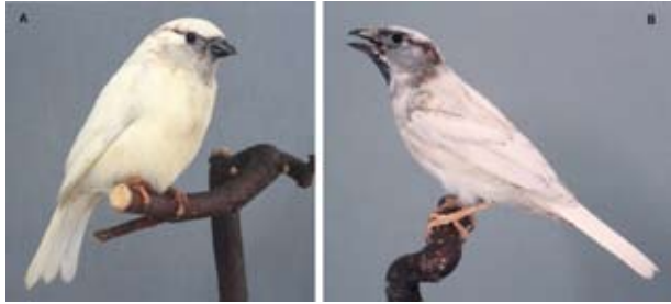
8. House Sparrow, adult males, Acromelanistic. Bred and kept in captivity. A: Melanin production mainly in the body extremities. B: bird moulted during a cold period resulting in sporadic production of melanin in other parts of the plumage.