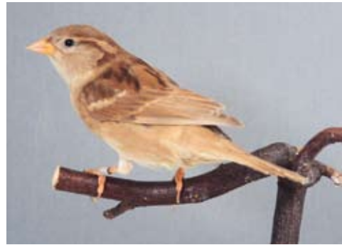
16. Brown House Sparrow, adult female, bred and kept in captivity. Fresh plumage.