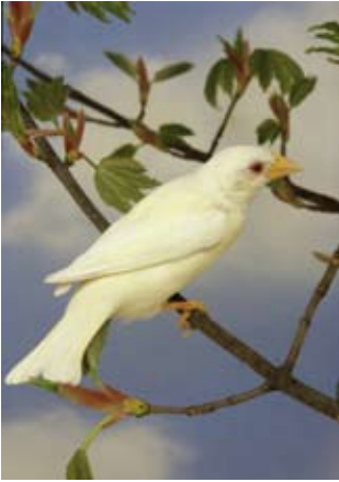
7. House Sparrow, adult female, Albino, hatched in the wild but kept in captivity.