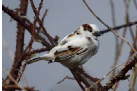
10. House Sparrow, adult male, April 2010, Garlieston, Wigtown, Scotland. White feathers caused by Progressive Greying (about 50% white feathers).