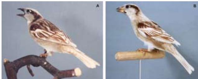
27. House Sparrow, adult males, Diluted - isabel, bred and kept in captivity. This distinct mutation in the isabel-group can express a variable degree of eumelanin reduction between individuals but the reduction is always strong to almost complete. A: This bird still has some visible eumelanin left. B: This is genetically the same mutation as the bird in Figure 27A. However, in this individual the reduction of eumelanin is almost complete and therefore it can be termed as schizochroism. Note that eumelanin is still present in the eyes, beak and feet.