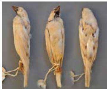
42. House Sparrow, adult male. Aberrant colour probably due to a non-heritable factor. Plumage has distinguishing marks of a complete melanin reduction, Diltion, and also some normal-coloured feathers on the chin. Specimen in the Natural History Museum, Tring.