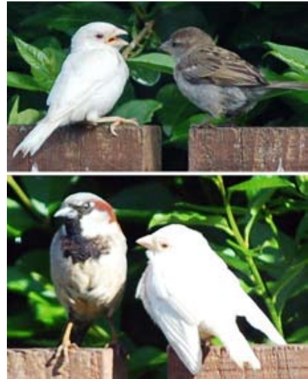
6. Juvenile House Sparrow, Albino, July 2009, Dirleton, Lothian, Scotland.