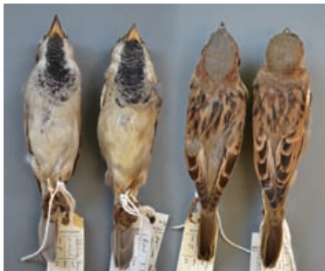
5. House Sparrows, two adult males collected at the same time of the year. The right bird clearly shows yellow carotenoid colouration. Specimens in the collection of the Natural History Museum, Tring.