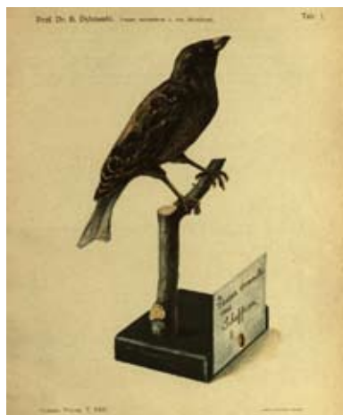
35. Passer domesticus var. Scheffneri , a dark coloured House Sparrow specimen thought by Dybowski to be a distinct variety. Plate from Dybowski 1915.