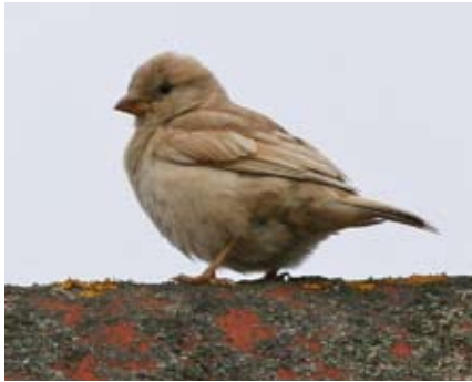
15. Brown House Sparrow, adult female, 11 May 2010, Germany. Old plumage and therefore strongly bleached by the light.