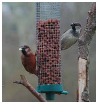
34. House Sparrow, adult male, December 2011, Ross-shire, Scotland. Pink colour due to carotenoids in the food.