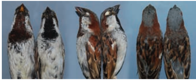
38. House Sparrows, adult males. Melanism category 3 (brown bib) on the left and normal-coloured on the right. Notice that the increase of pheomelanin is not only in the bib but also in the neck and mantle plumage. Specimens in the collection of the Natural History Museum, Tring.