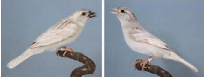
20. House Sparrow, adult male and female, Dilution – pastel, one of the distinct forms in the pastel-group; strong reduction of eumelanin while the pheomelanin is almost lacking completely. Bred and kept in captivity.