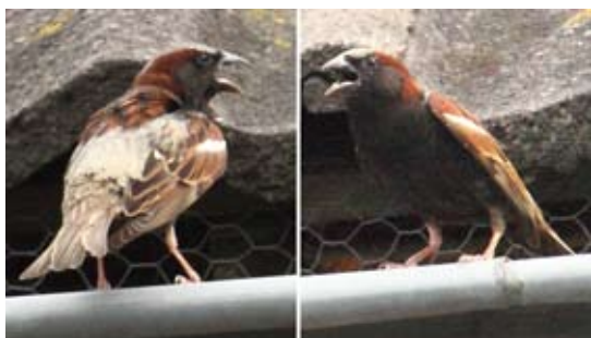
33. House Sparrow, adult male, Melanism Category 1 in partially worn breeding plumage, June 2011, Andijk, The Netherlands.