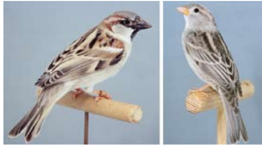
22. House Sparrow, adult male and female, Dilution – pastel, exhibiting the average degree of melanin reduction within this variable pastel-mutation. In this mutation the black eumelanin is proportionally less affected than the pheomelanin and brown eumelanin. Bred and kept in captivity.