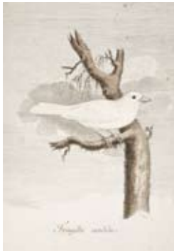
1. White sparrow Fringilla candidans in Sparman, 1786, Museum Carlsonianum.