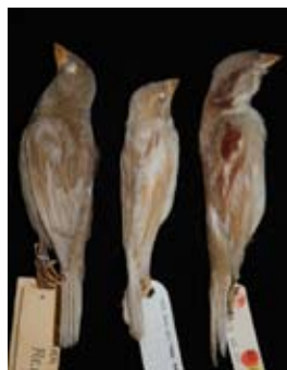
26. House Sparrows, adult female, juvenile male and adult male, Diluted - isabel. In this distinct form the degree of eumelanin reduction is always the same. Specimens in the American Museum of Natural History (female) and the Natural History Museum, Tring (males).