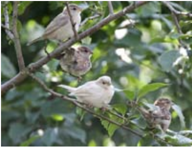
21. House Sparrows, three juveniles and an adult female, 29 June 2011, Ooijpolder, Nijmegen, The Netherlands. Two juveniles, from the same nest, showing the variable expression of melanin reduction within this pastel-mutation.