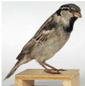
39. House Sparrow, adult male, Melanism category 3. Another distinct form in this category; in this case the pheomelanin is replaced with eumelanin. Specimen in the Niedersächsisches Landesmuseum, Hannover.