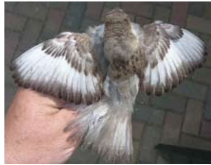
14. Juvenile House Sparrow, May 2011, Zwolle, The Netherlands. Loss of pigment as a result of physical disorders.