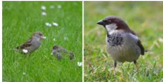
4. House Sparrows, adult male, adult female and juvenile.