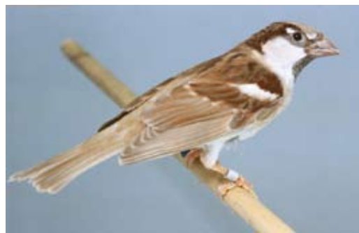
18. Brown House Sparrow, adult male, bred and kept in captivity. Because Brown is recessive in inheritance and the gene is located at the X-chromosome, males are not likely to be found in the wild.