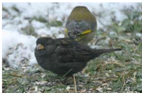
36. House Sparrow, adult female, Melanism Category 2, January 2006, Longecourt en Plaine, France.