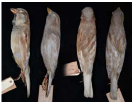
25. House Sparrow, adult male and female, Diluted - pastel. Another distinct form within the pastel-group. The eumelanin is affected more than the phaeomelanin. Specimens in the American Museum of Natural History.