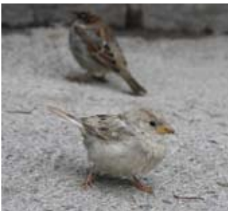
23. House Sparrow, female (post-juvenile moult almost completed), Oslo, Norway, September 2009. Dilution – pastel, exhibiting a stronger degree of melanin reduction within this variable pastel-mutation.