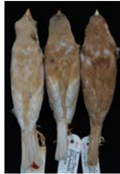
2. Brown House Sparrows, three adult females. Aberrant coloured feathers are easily bleached by light. Old plumage (left) can be much lighter in colour than fresh plumage (right). Specimens in the collection of the Natural History Museum, Tring.