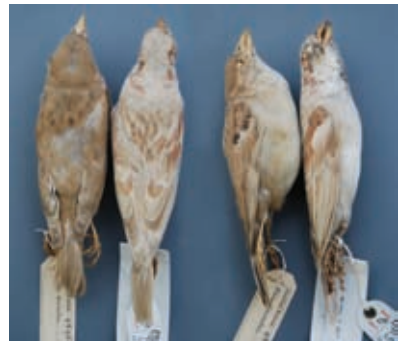
24. House Sparrows, adult female and adult male, both Diluted – pastel, and likely another distinct mutation within the pastel-group. Male in old and bleached plumage. Some new feathers show the true colour of this mutation. Specimens in the American Museum of Natural History (female) and the Natural History Museum, Tring (male).