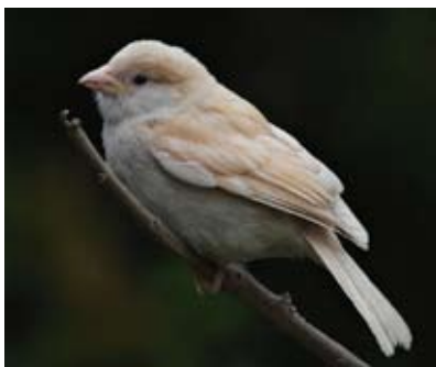
17. Juvenile House Sparrow, Brown, 24 July 2010, St. Mary's, Isles of Scilly, England.