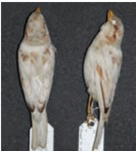
41. House Sparrow, adult male. Aberrant colour probably due to a non-heritable factor. Plumage has distinguishing marks of a complete eumelanin reduction while a few primaries are normal coloured. Specimen in the National Museums of Scotland, Edinburgh.