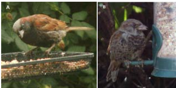
32. A: House Sparrow, adult male, Melanism Category 1 in partially worn breeding plumage, June 2012, Mitcham, Surrey, England. B: House Sparrow, male, Melanism Category 1 in fresh plumage with buff fringes, August 2012, Mitcham, Surrey UK.