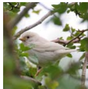
30. Juvenile House Sparrow, Ino - light form, July 2007, Lolland, Denmark.