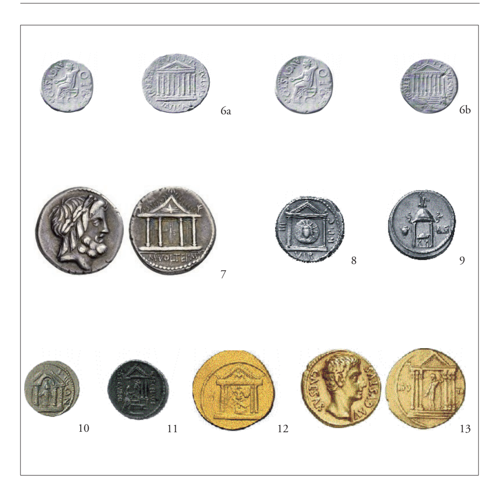
Figures: 1a – RIC 1<sup>2</sup> 507; 1b – RIC 1<sup>2</sup> 39a; 1c – RIC 1<sup>2</sup> 69a; 1d RIC 1<sup>2</sup> 103; 1e – RIC 1<sup>2</sup> 108a; 2 – RIC 1<sup>2</sup> Tiberius: 67; 3 – RIC 1<sup>2</sup> Nero 270; 4 – RRC 480/21; 5 – RRC 540/2; 6a – RPC 1 222; 6b – RPC 1 224; 7 – RRC 385/4; 8 – RRC 496/1; 9 – RRC 428/1; 10 – for further reference, see T. Drew-Bear, Representations of temples on the Greek imperial coinage , ANSMN 19, 1974, p. 27-63; 11 – RRC 439; 12 – RIC 1<sup>2</sup> 273; 13 – RIC 1<sup>2</sup> 27