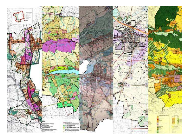
Fig. 2. Compilation of fragments of graphical records of the SUiKZP of municipalities in the Poznań metropolitan area. The ambiguity and incoherence of the records makes them difficult to coordinate (at the level of the municipality and agglomeration), prevents comparative analyses from being carried out, is a source of spatial disorder and leads to infrastructural collisions. In effect, it is one of the reasons behind the low effectiveness of urbanistic solutions