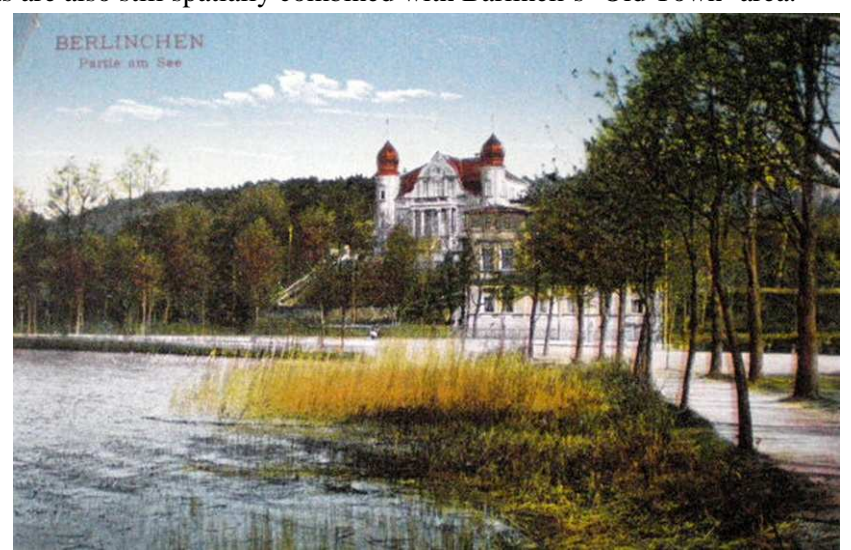
Fig. 1. Pre-war postcard of Berlinchen, showing the excellent location of the Villa Duelfer against the forest and lake.

three sides is a forest (Fig. 1). Looking at the location and urban composition of the area, the villa's grounds blend into the green, tourist part of the place, which is slightly spatially separated from the centre in such a way that the two zones are axially linked by the clear, simple passage of Strzelecka street. The green areas are also still spatially combined with Barlinek's 'Old Town' area.