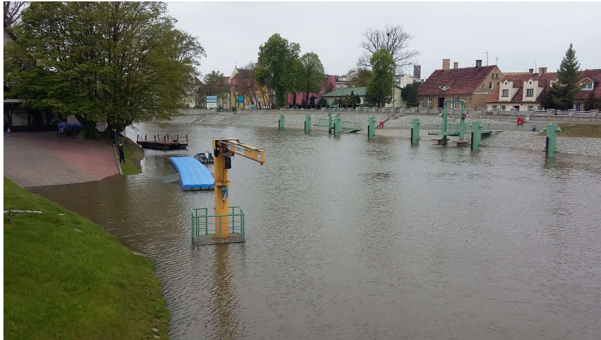
Photo. 1. The flood wall - the river port in Nowa Sól – May 2017