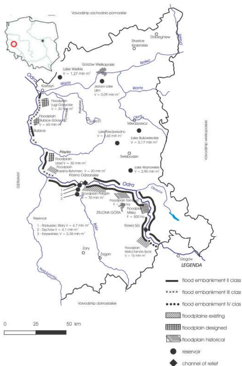
Fig. 1. Flood protection facilities in the Lubuskie Voivodship

Połupin (4125 ha) and Krzesin-Bytomiec (1200 ha), and the following polders are planned to be constructed: Urad (30 million m 3 ), Słubice Górzycza (60 million m 3 ) and Ługi Górzyckie (30 million m 3 ) - Fig.1.