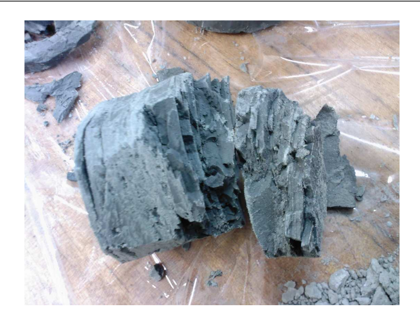
Fig. 1. A soil sample with a visible altered structure