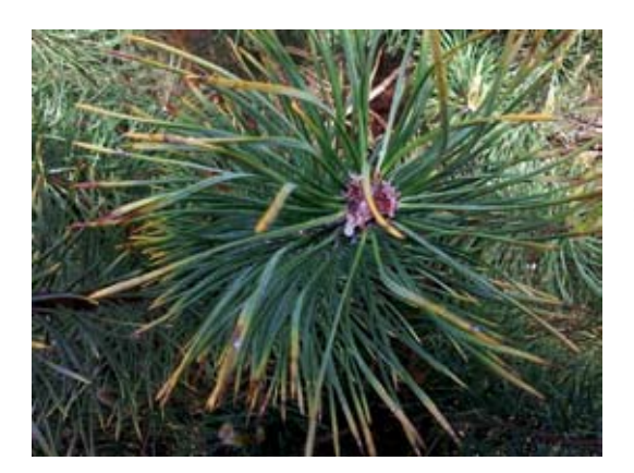
Fig. 2. Leaking juice