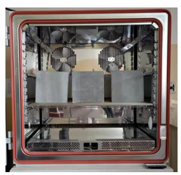
Fig. 5. View of the tested samples in the climatic chamber