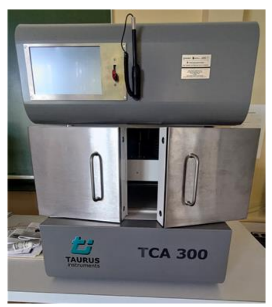
Fig. 4. Thermal Conductivity Tester TCA 300 DTX used for research

For the test, six reference samples and six samples with the addition of 5% PCM with dimensions of 300x300x100 mm were made (Fig. 3). The samples were tested in three temperature ranges, i.e., 5°C, 15°C, and 25°C.