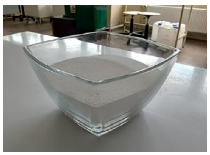
Fig. 3. PCM used in the research

Per the properties declared by the manufacturer, the phase change material used is characterized by the technical parameters in the table. 1.