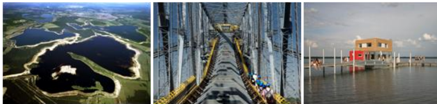
Phot. 1-3: New Lusatian Lakeland, Visitor mine F60, Floating diving school