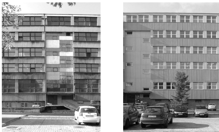
Fig. 5-6. The attitude of the partial acceptance - the Department of Civil Engineering Laboratory, Silesian University of Technology. Designed by Professor T. Teodorowicz-Todorowski (1973), Elevation before and after thermal insulation in 2012. Its project, completely obliterating the original features of the building, although obtaining a building permit, the attorney of the Academic District, Dr. G. Nawrot, protested thanks to which the building has partially retained some features characteristic for modernism. Unfortunately, the elevations have lost their original avant-garde character. Photo by R. Nakonieczny 2012.

The material and technological values are considered, inter alia , in terms of the type of the construction technology, building materials and finishing. There is an element of authenticity as the value which may classify the object to be protected by the historic preservation officer. While for the assessment of the object it is important to consider the number of similar objects (frequency of occurrence), the originality of applied solutions or its uniqueness, in the analysis of modernist buildings it should be considered that some of them may be based on “typical projects”, but they may present a significant value for their scarcity.