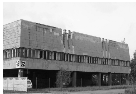
Fig. 4. Former House of Silesian Scientific Institute in Katowice, designed by Stanisław Kwaśniewicz, 1972.

The most important aspects to be considered in the project activities relating to the objects of the years 1945 to 1989 should include: the formal and compositional values, functional and structural values, material and technological values, historical and cultural values.