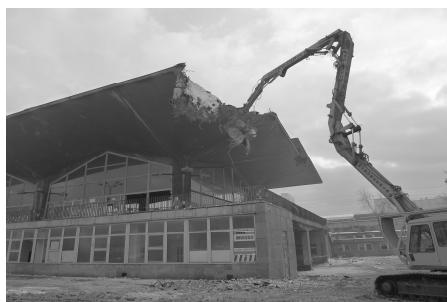
Fig. 3. The beginning of the demolition of the Railway Station in Katowice.