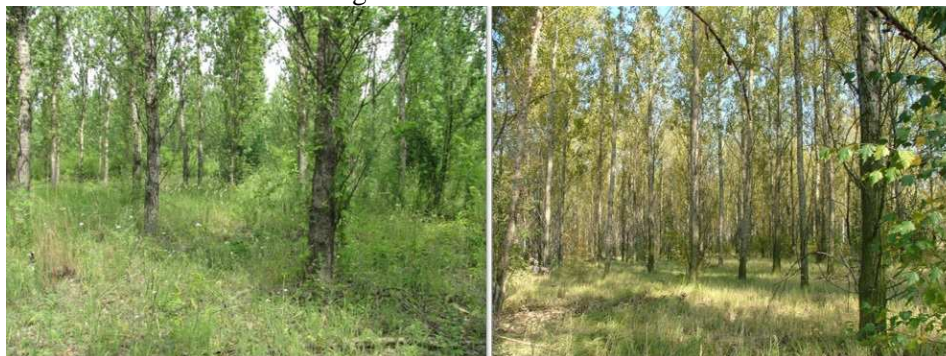
Fig. 2. Protective forest shaping at site B and Z1

The study was conducted in the area of protective forest where the dominant species were Populus robusta L. and Betula pendula Rorth. The sanitary zone outlook has been shown in Fig. 2.