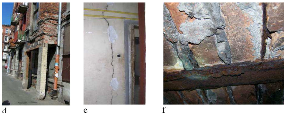
Fig. 2. Townhouses of Pachulski, 2a-view from the backyard, 2b - woodcuts on existing trees, 2c-wall defects in the facade from the Stalowa street, 2d-damaged exterior pillars, 2e-strong scratch of structural walls, 2f- corrosion of the steel beams of the basement floor.