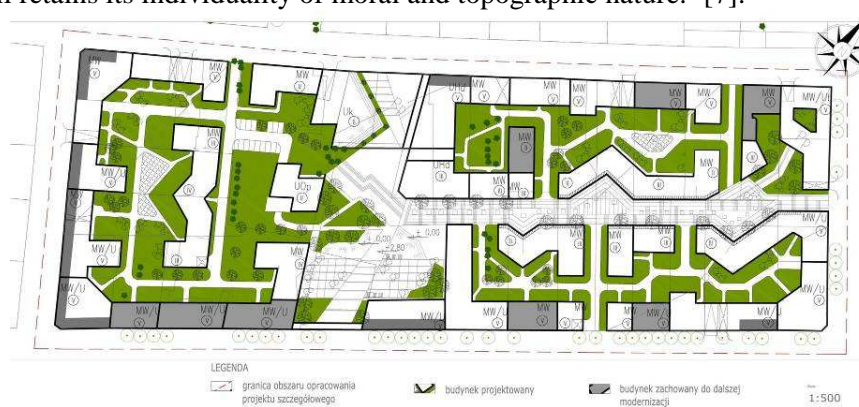
Fig. 3 An example of the concept of modernization of the building quarter of "New Praga", general area of building: approx. 80 thousand square metres, 950 flats, building intensity - 2 Source [9]

very affluent, create a specific, unique community of "former Praga", which still retains its individuality of moral and topographic nature. 6 [7].