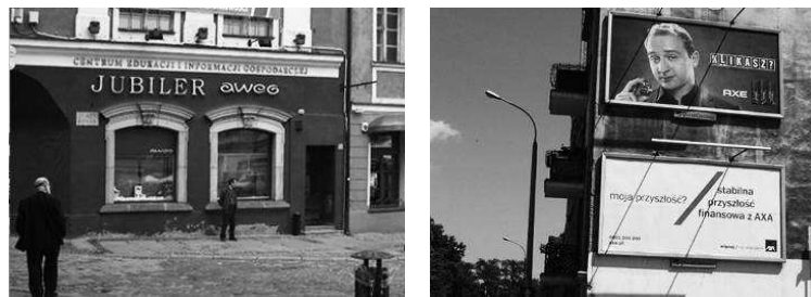
Fig. 3. Photographic documentation of analyzed advertisements located in the city center of Poznań. On the left - locating advertisement (advertising signboard over jeweler's shop), on right - promoting advertisement (does not direct to any location in the city)