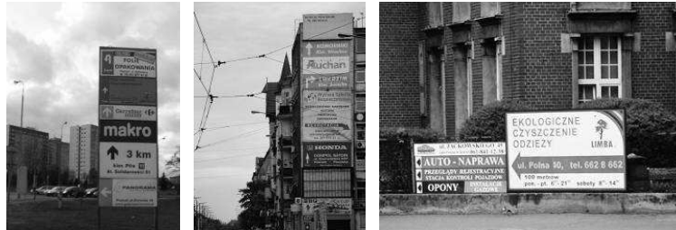
Fig. 2. Photographic documentation of analyzed advertisements located in the city center of Poznań. Examples of leading (directing) advertisements