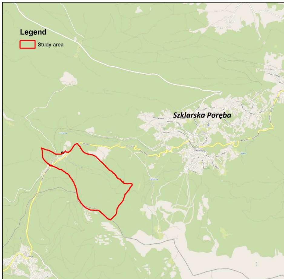
Fig. 2. Study area

Due to different mechanisms of water cycling related to the geographic region and topographical setting, forest may influence stream flow characteristics in a variety of manners. Here, we focus on forest in mountain catchment headwater which is considered by NWRM catalogue as having high impact on the flood risk. Our research site is headwater of the Kamienna river located in the western part of the Sudetes Mountains.