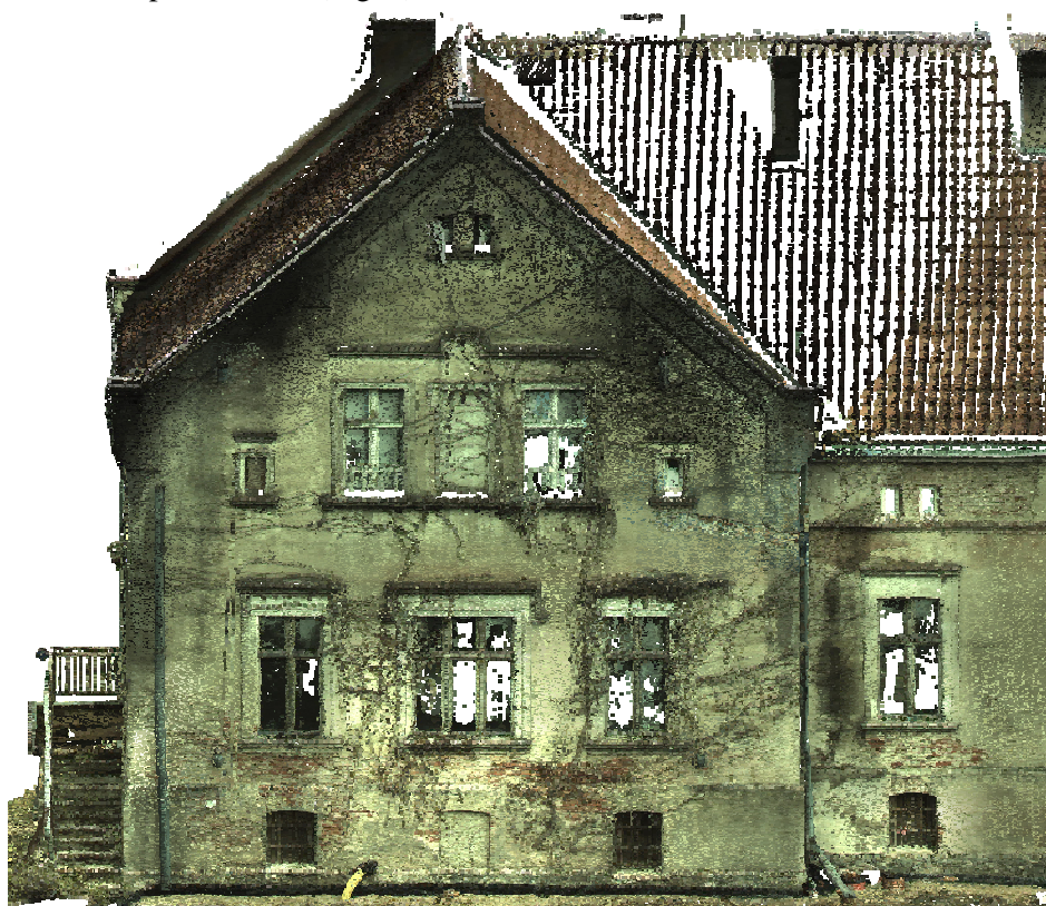
Fig. 4. Destroyed facade of a historic building

High accuracy of measurement guarantees high-quality point cloud, which is also an accurate representation of the given object (Fig. 4). The three-dimensional data obtained by the instrument, enable inventory and description of the loss or damage to the facade of the building, as well as deformation in a structure [4, 6]. Having the cleaned point cloud itself we are able to observe where on the object occur such abnormalities and perform their measurement on the computer screen (Fig. 5).