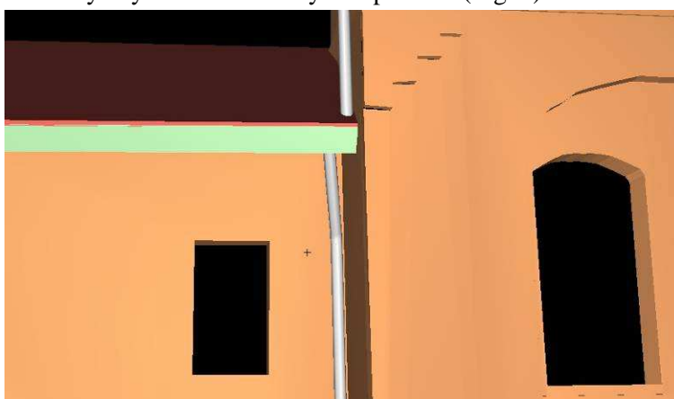
Fig. 2. Modelled fragment of the facade using the surfaces

"covers" all irregularities occurring on the object. The problem of covering also relates to all kinds of openings, for example windows, which are located on the wall. Therefore, they require manual separation. Elements that are not flat (e. g. rainwater pipes) can be modelled by using e. g. the cubes or cylinders, which are given a proper thickness and "are pulled" along the designated axis. Working with the "patch" command is quite tedious because it requires manual creation virtually any of the necessary components (Fig. 2).