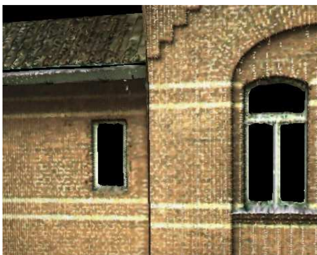
Fig. 3. The same fragment of the facade (see Figure 2) modelled using TIN grid