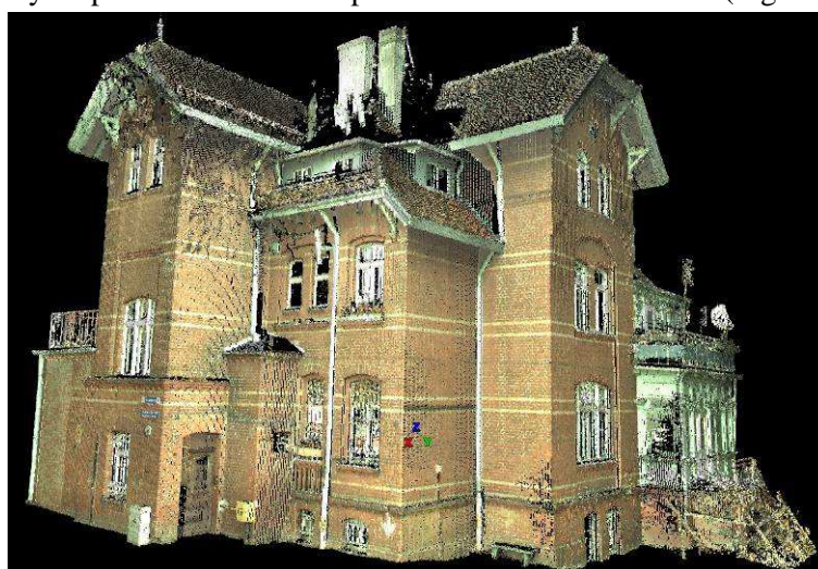
Fig. 1. Scanned building with superimposed images

Thanks to scanner Leica ScanStation C10, which was used to make field measurements for presented objects in this report, it became possible to completely map their authentic shapes and textures and colours (Figure 1).