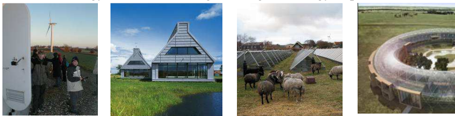
Fig. 4. The island Samsø-Denmark; a) one of the 11 wind turbines - co-ownership of a local cooperative; b) the facility of the Samsø Energy Academy in Ballen; c) solar farm - Nordby; d) a plan of Samsborg campus; Source: energyacademy.dk [5]

Samsø, as the first Danish island well balanced in terms of energy, and neutral in terms of CO 2 emissions within the strategy Samsø 2.0, according to which the island strives to achieve complete independence from fossil fuels by 2030. There were no social protests related to investments in energy. There were no NIMBY effects (not in my back yard), i.e. protests against launching energy projects in the area of residence, despite the general acceptance for the implemented idea. An opposite phenomenon seems to frequently occur, i.e. IMBY - “a windmill in my backyard”. A total number of 11 wind turbines, owned by private investors or by local energy cooperatives - supply energy to the nearby households. There are 10 turbines (offshore type) operating at sea, and the excess energy is sold to the mainland. 75% of heat demand is produced in 4 professional heating plants. The construction of the heating plants was financed by the Danish Energy Authority , most of them belong to heat consumers, others are owned by the local company. By 2030, the island is planning to reduce thermal energy consumption in buildings by 33%, and for the last 5 years all new houses (and the modernized ones) have been constructed as low-energy houses or passive houses 10. Other individual households use renewable energy installations and generate green energy as prosumers [5, 6].