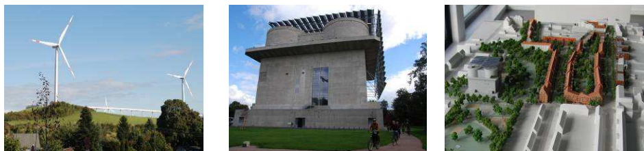
Fig. 1. Hamburg - Wilhelmsburg a) Energieberg Georgswerder b) Energiebunker, c) Weltquartier model - revitalized settlement from the 1930s

In the field of renewable energy sources, 14.500 jobs have been created here, and within the metropolitan area - 24.700. City implements strategies for sustainable public transport combined with electric mobility. By 2025, a total number of 525.000 low-energy-consuming dwellings will be constructed there. As part of IBA Hamburg, the city opted for the revitalization of vast brownfields, ports and degraded “inner peripheries” on the islands of the river Elbe, while transforming their energy systems, included in the plans of self-sufficient Wilhelmsburg. An important issue, among the IBA initiatives, was a symbolic “crossing the river Elbe” - connecting the isolated islands with the rest of the city, while developing social and educational infrastructure. The revitalization of the downtown areas was carried out in line with the strategy of sustainable land management, which maintains the green areas of the city [1,2].