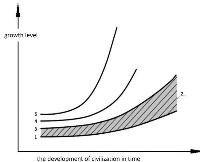
Fig. 1. Schematic growth in activities of urban areas revitalization: 1 - the actual level of revitalization, 2 - increase in revitalization backlogs, 3 - level of socio-economic revitalization, 4 - economically justified level of revitalization, 5 - level of social expectations

generate increasingly growing socio-economic loss (Fig. 1). All previous attempts to create a system of legal and financial support for urban regeneration did not produce results. However, individual regeneration activities, of a selective or limited scope, will not bring sufficient results. Renovation of individual buildings, often historic buildings, engineering structures, or fragments of urban technical and transport infrastructures, may be insufficient in solving the contemporary problems of our towns. In addition, all previous attempts to create a national program of urban regeneration, as well as the implementation of the financial system to support revitalization activities have not produced results, too. There are no rules, procedures or methods of organization of contemporary revitalization processes as well as no legal basis for the state to support the revitalization activities. Therefore, it is believed that the discussion on the issue of urban revitalization is fully justified and purposeful.