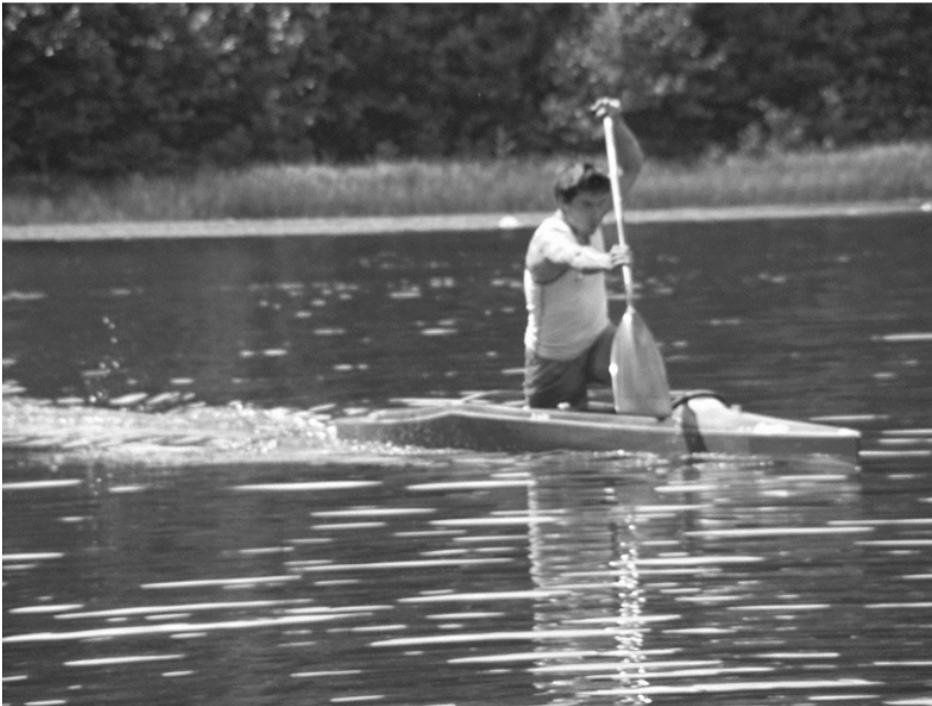
Figure 1. A competitor while paddling a canoe.